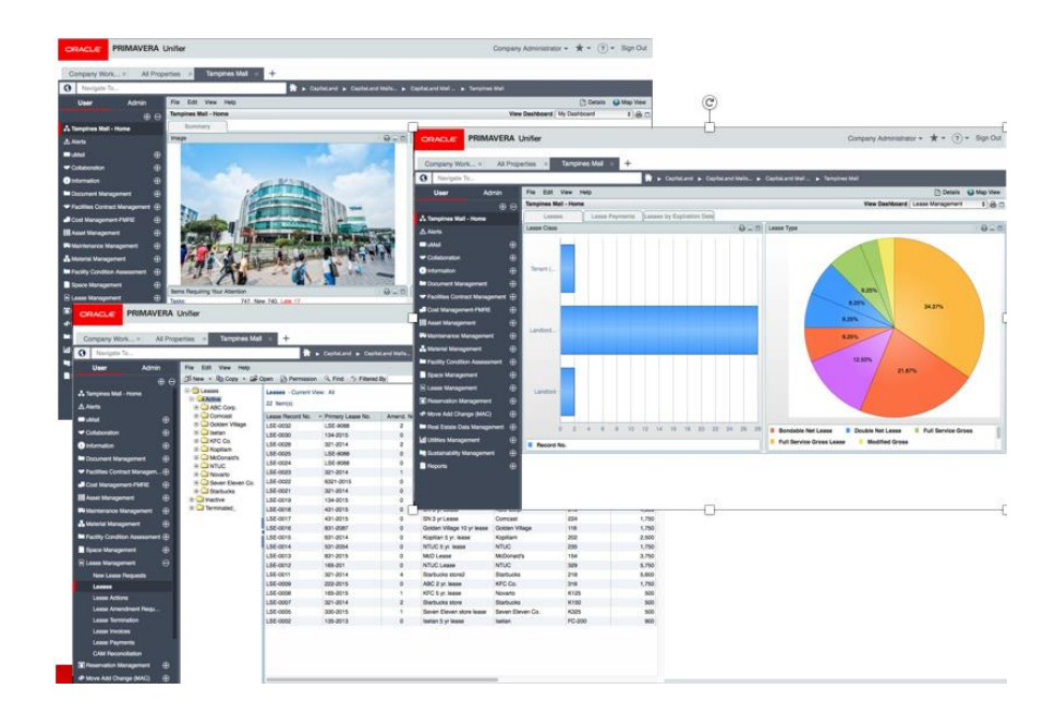
Figure 2. With Primavera Unifier Facilities and Real Estate Management you can organize your properties by any hierarchy that supports your real estate portfolio.

Primavera Unifier Facilities and Real Estate Management lets you view, compare, and report on any information for a single property or across your entire real estate portfolio—all in real time. Providing automation, flexibility, and the power to handle customerspecific real estate management needs.